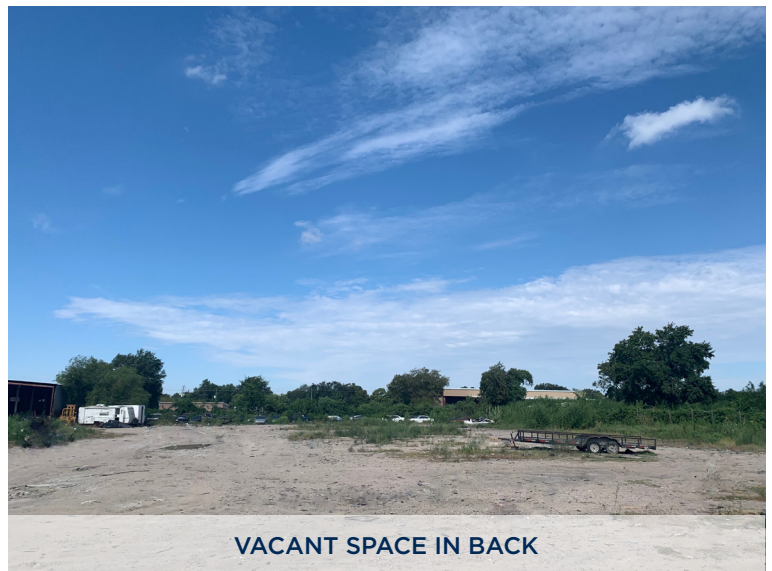
VACANT SPACE IN BACK