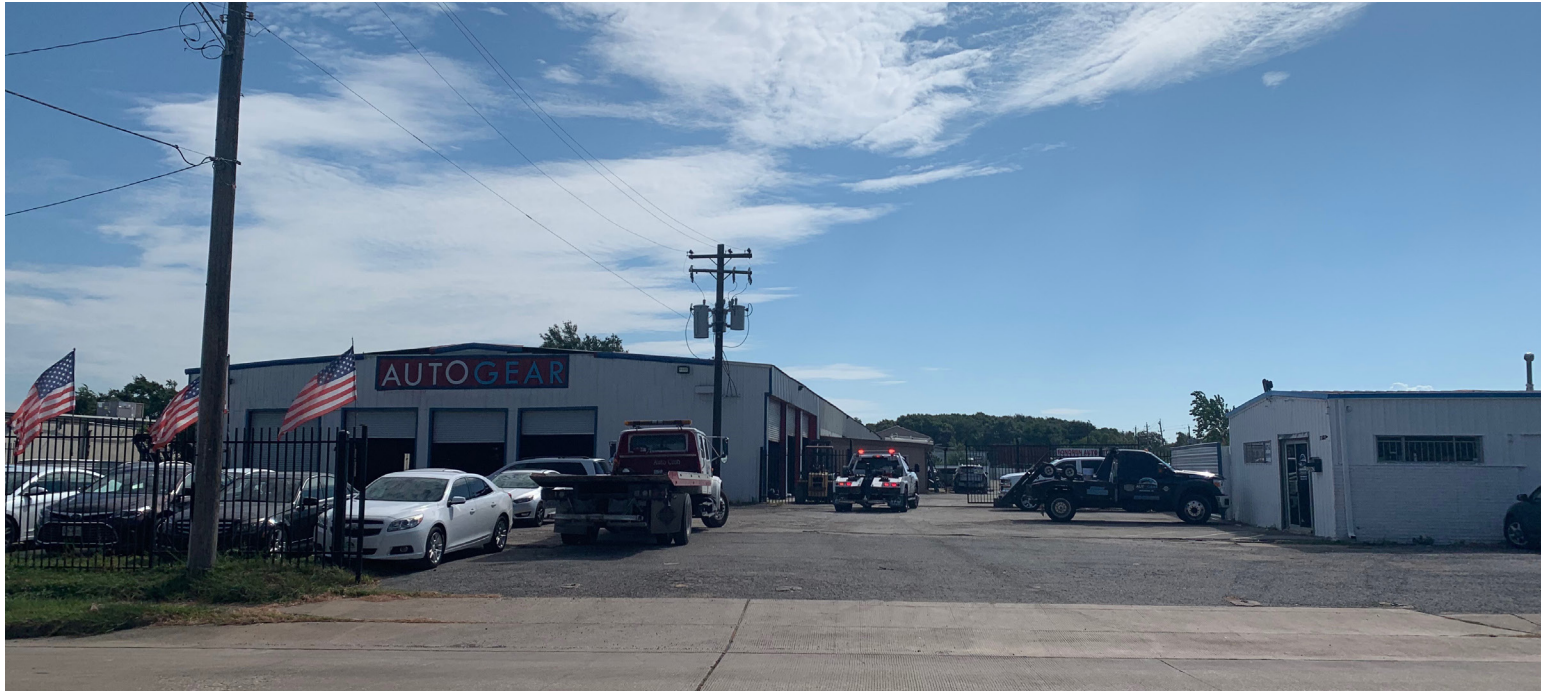
MAIN ENTRANCE OF SITE